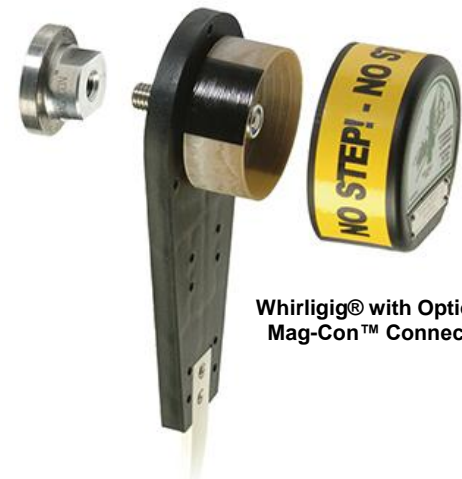
Whirligig® with Optional Mag-Con™ Connector