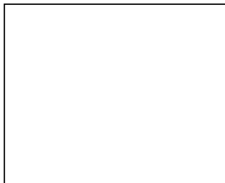
Example of Bearing Failure