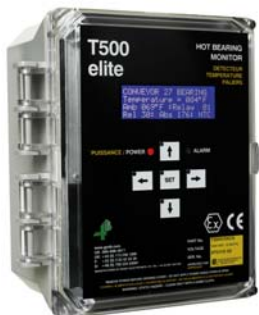
T500 Hotbus Elite

Temperature Sensors can be used with the following 4B Hazard Monitoring Systems